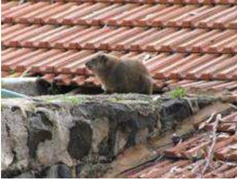
The hydrax, or coney

(old Scottish/Gaelic “Krayg,” or Craig, as in Craighouse®). And from them God sent forth the Savior of all creation.