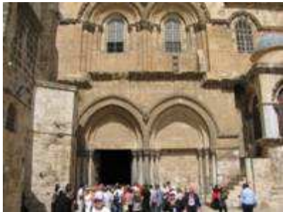
Church of the Holy Sepulchre

No where more than Israel is made manifest the damage caused by obstructing, with sectarian ritual, the living water of Christ's Holy Spirit. Here, in the land where Christ strode free and set free, restoring sight to the blind and healing the leper, divinity has been carved up and parceled out, controlled by the fiefdoms of various denominations. In the Church of the Nativity in Bethlehem, for example, three different denominations control different parts of the cathedral that shelters the birthplace of Christ. The sound of human laughter is forbidden inside the church – no kidding.